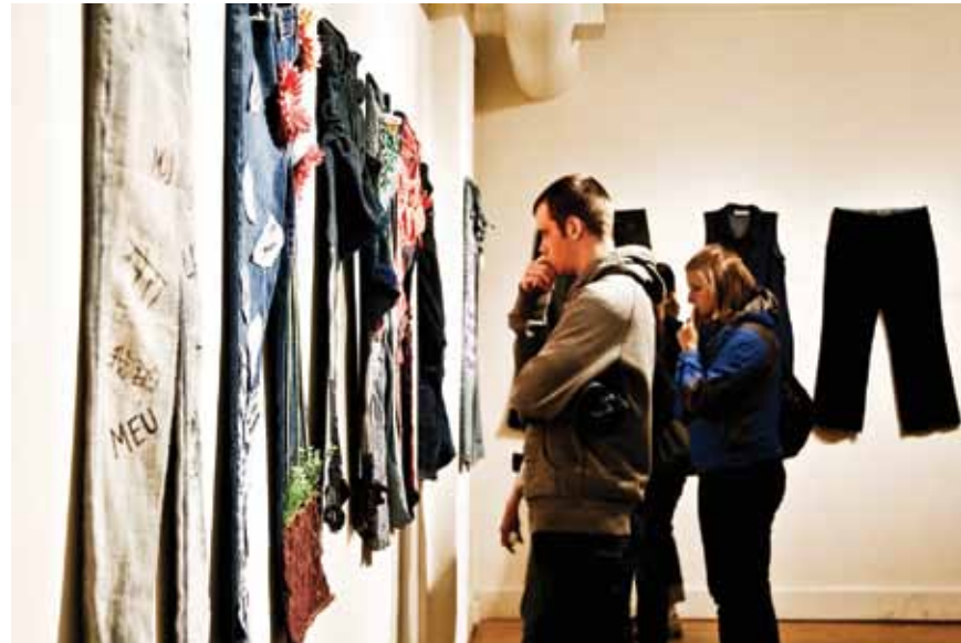
All Denim Day photos

Taken as a whole, the Denim Jean Art reflected ongoing efforts continuously made to spread awareness, to break the silence, and to empower all of us to unite together in an effort to end sexual violence. Thank you to all of the participants and to everyone who came to the show!